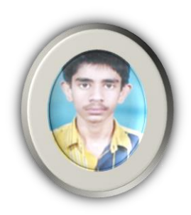
ABHIRUP AIR – 10 (2018)