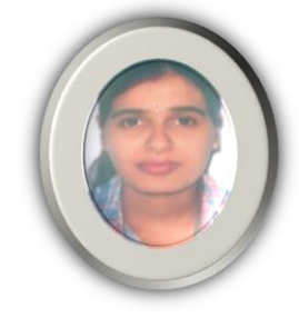
GARIMA AIR – 35 (2012)